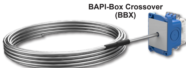
BAPI-Box Crossover (BBX)