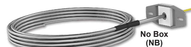
No Box (NB)

(See the Accessories Section for more info.)