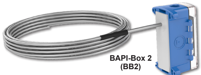
BAPI-Box 2 (BB2)