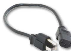
18" Power Cord