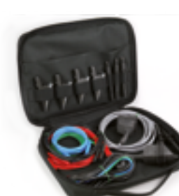
Soft carrying bag for accessories.