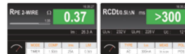
2-wire continuity test