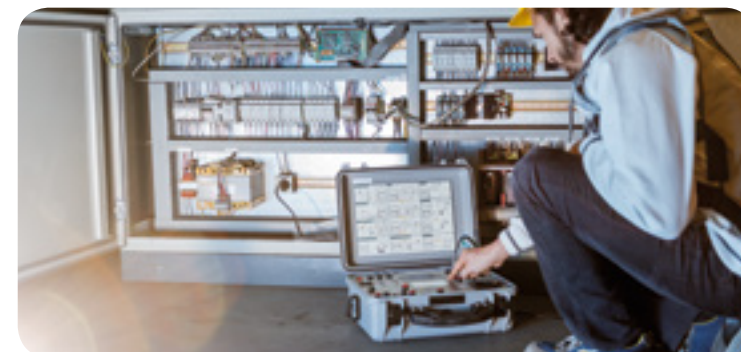
FULLTEST at work

Further to measurements of protective conductors' continuity, insulation and dielectric strength , FULLTEST3 is capable of carrying out tests on RCDs type A, AC and B, General, Selective and Delayed, measurements of Line/Loop impedance also with high resolution 0.1mΩ (with optional accessory IMP57), measurement of non-trip earth resistance and leakage current with clamp transducer. It can also carry out test on breaking capacity, protection tripping, I2t tests relevant to magneto-thermal circuit breakers in curve B, C, D, K and fuses type gG and aM. The device is also provided with a "touch-screen" colour display and 3 USB ports for connection to PC, USB pen drive, USB printers and possible bar code readers.