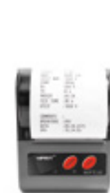
Compact USB printer with rechargeable battery