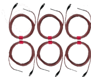
Temperature probes 6 x 50 mm (1.97 in) + 5 m (16.4 ft) cable set