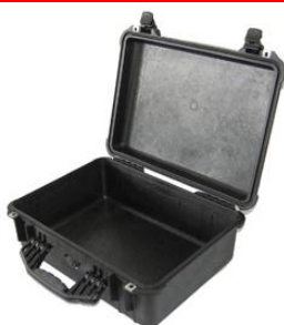
Cable plastic case