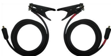
Current cables with battery clamps

Specifications are valid if the instrument is used with the recommended set of accessories