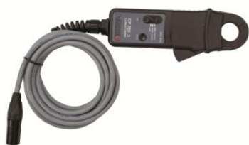
Current clamp 30/300 A with extension 5 m (16.4 ft)