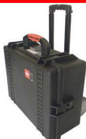
Cable plastic case with wheels