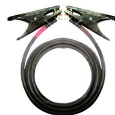
Current connection cable