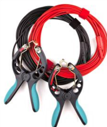
Voltage Sense cables with TTA clamps